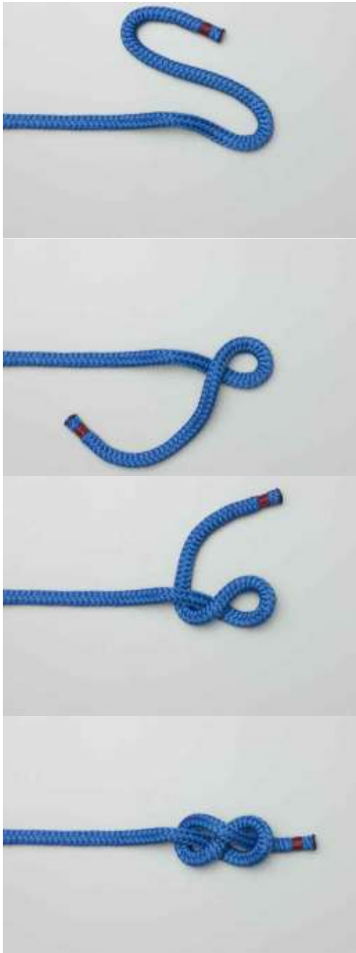
Figure of eight knot

Pass the tail over itself to form a loop.